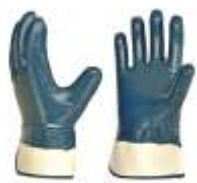
Nitrile Coated Cuff Type