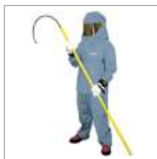
Arc Flash Suit