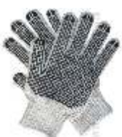
PVC Dotted Gloves