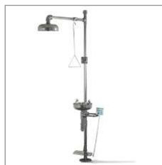
Eye Wash Shower