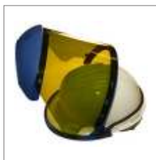
Face Shield With Helmet