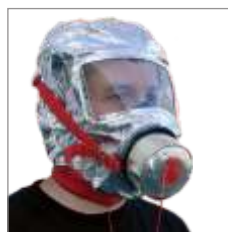
Fire Escape Mask