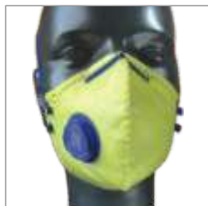
Foldable Type Mask