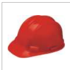
Executive Pin Lock Type