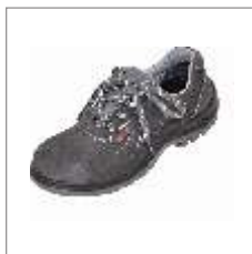
Executive Safety Shoes