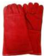
Leather Red Winter