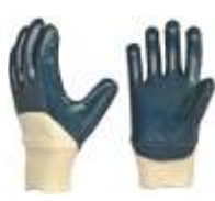
Nitrile Coated Elastic Cuff