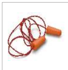
Disposable Ear Plug