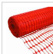
Barricading Safety Net