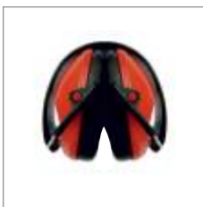
Ear Muff Foldable