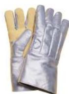
Kevlar Aluminized Gloves