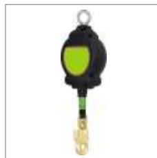
Retractable Fall Arrestor