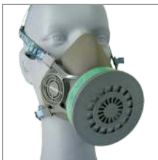
Half Face Mask