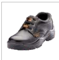
PU Single Density Sole