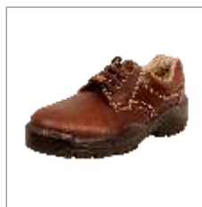
Executive Safety Shoes