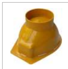
Loader Safety Helmet