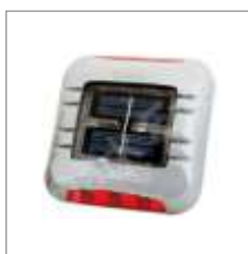
Solar Powered Stud