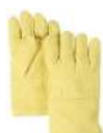
Full Kevlar Gloves