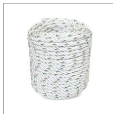
Life Line Rope