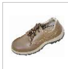
Executive Safety Shoes