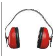
Ear Muff Regular