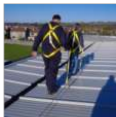
Fixed Line System