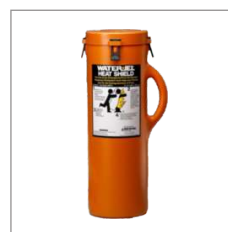
Water Jet Blanket