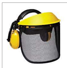
Face Shield with Ear Muff