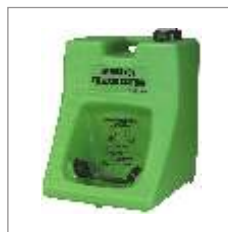
Eye Wash Station