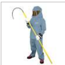
Arc Flash Suit