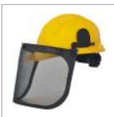
Helmet with Face Shield