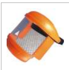
Grinder Face Shield