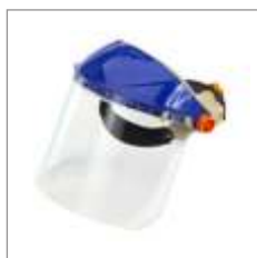
Chemical Splash Face Shield