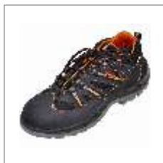
Executive Safety Shoes