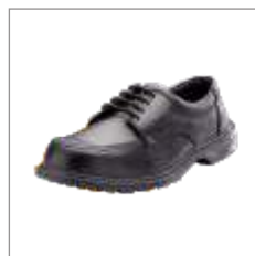
PVC Sole Shoes