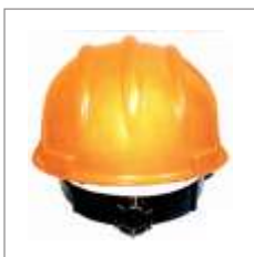
Executive Ratchet Type