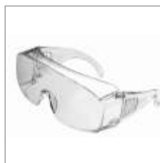
Over Specs Goggle