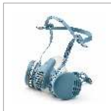
Half Face Mask