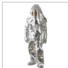
Aluminized Fire Suit