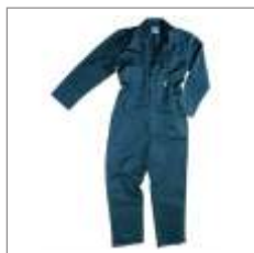
Cover All Suit