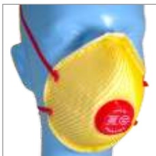
Cup Type Mask