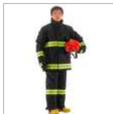
Nomex Fire Suit