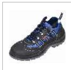
Executive Safety Shoes