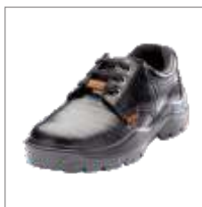
PU Double Density Sole