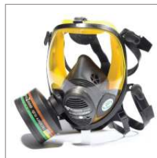
Full Face Mask