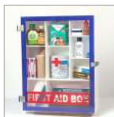
First Aid Box