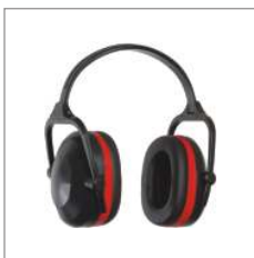
Ear Muff Premium