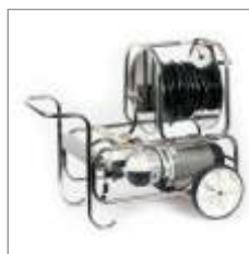
Trolley Mounted BA Set