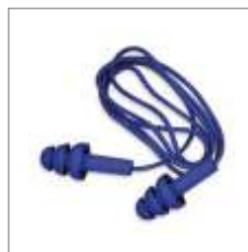
Reusable Ear Plug